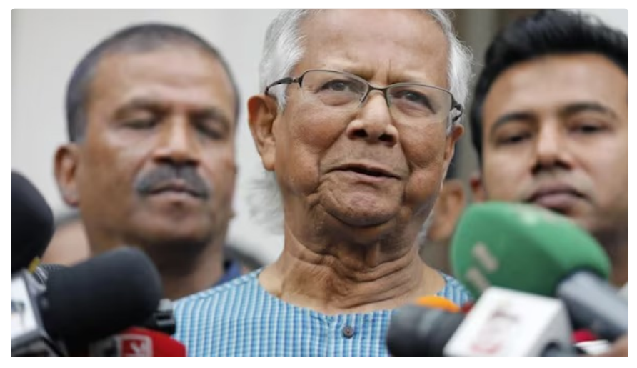
The aftermath of Shiekh Hasina's ouster has also seen a troubling increase in sectarian violence, which is the toughest challenge for the Muhammad Yunus' government to tackle.

The return of previously suppressed Islamists and jihadists could be supported by external forces seeking to destabilise the region for their strategic gains