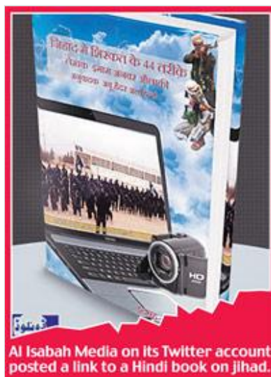
Al Isabah Media on its Twitter account posted a link to a Hindi book on jihad.

The Facebook page also has several links leading to jihadi literature in Urdu, including a booklet on "Jihad: The forgotten obligation" attributed to a writer named "Ubaidha al Hindi".