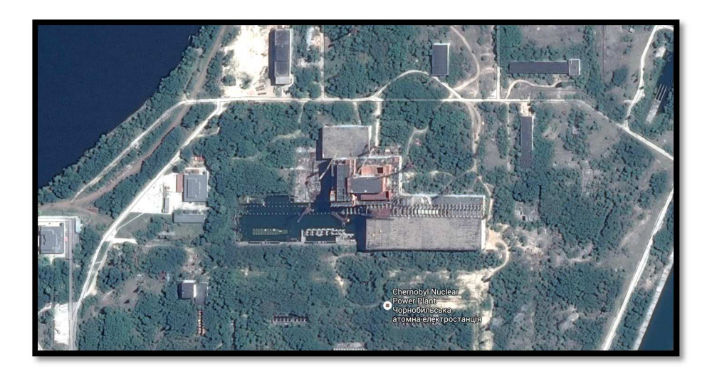
(Birds eye view of the Chernobyl Plant, Ukraine)

The Greenpeace foundation has correctly observed the situation by stating, "the damaged reactor is still a danger". Nearly 29 years have passed since the accident; the region is still under the spell of lethal radioactive fallout.